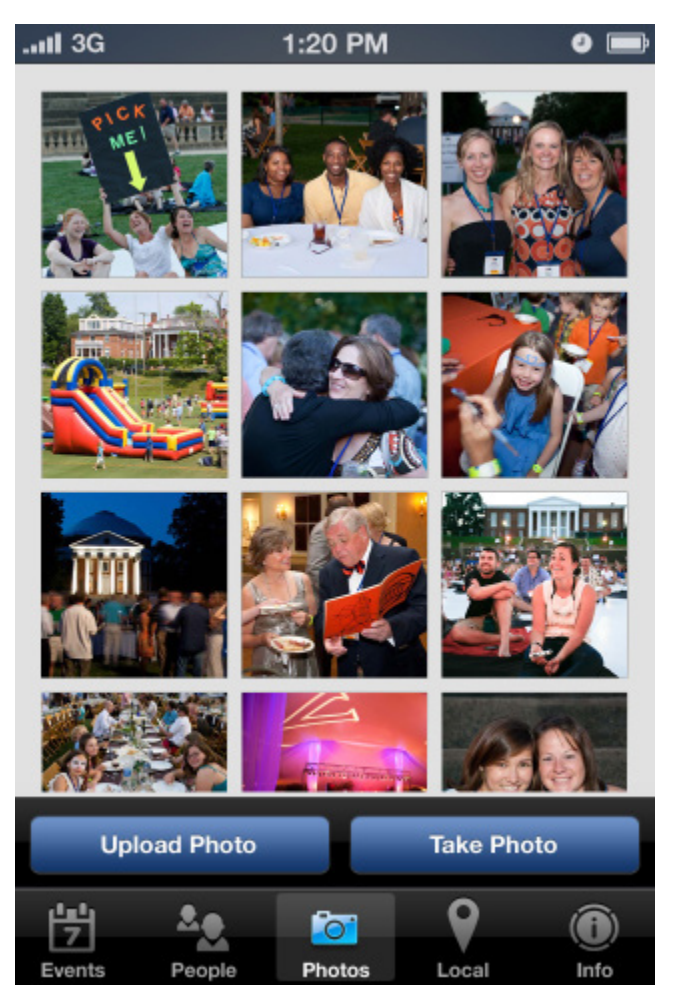
Figure 2: Alumni could view photos taken by their classmates, post their own photos, and tag other alumni and event locations in each photo they posted.

In the future, we can imagine allowing participants to register for events directly from the app, and use it to plan their schedules. We would like to see support for wayfinding within the event space, so people will be able know where they are and get where they want to go without having to use a printed map or seek help from a staffer. With ubiquitous networking, the mobile phone is quite literally the perfect vehicle to deliver a superior events experience.